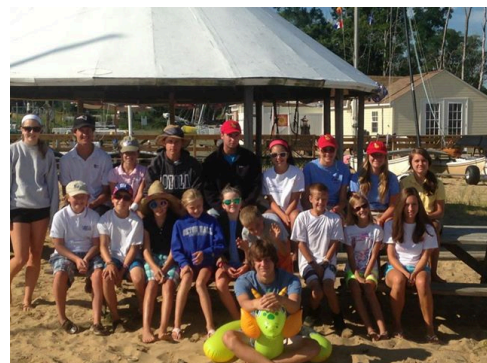
Adventure Week Class on 'Dress Like Your Favorite Instructor Day'

We closed the season with our traditional year end party. This year we hosted it at SHBCC. We had nearly 100 AHSEP guests, and had a naming ceremony for our new boats where the little sailors made invocations to the gods of the wind and each boat was christened. It was a perfect end to a season where, in spite of the challenges, we had record enrollment, and a tremendously successful season. As I gave the remarks at the party, I related the story of how this season emerged, and spoke about the tremendous outpouring of support from AHYC (who knows us well) but also from SHBCC who did not know us at all. Without hesitation, sailors supported sailors. We are incredibly grateful to your club, and we look forward to building our relationship with the catamaran club for the future. What started out as a tactical solution has us talking about how we can collectively work to ensure that we continue to build the visibility and create more sailors on the Bayshore.